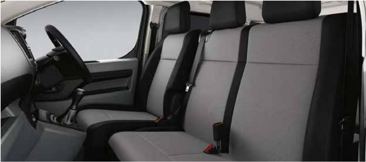
Tritone Grey fabric interior trim